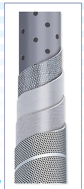
Simultaneous forming of components